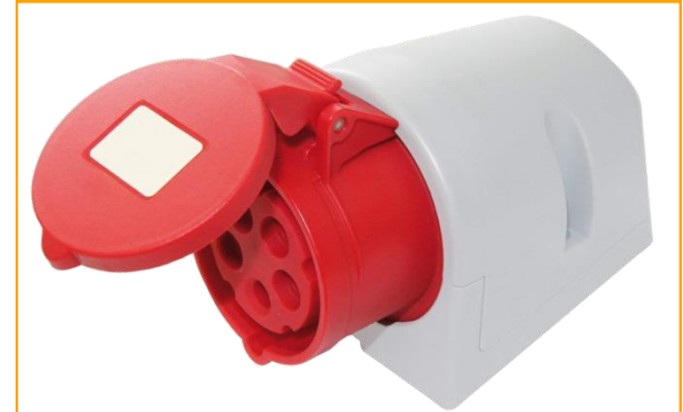
CEE 3P+N+E 6h 415-volt 32-ampere power socket.

How to use : to measure voltages on a CEE 3P+N+E 6h 415-volt 32-ampere power socket.