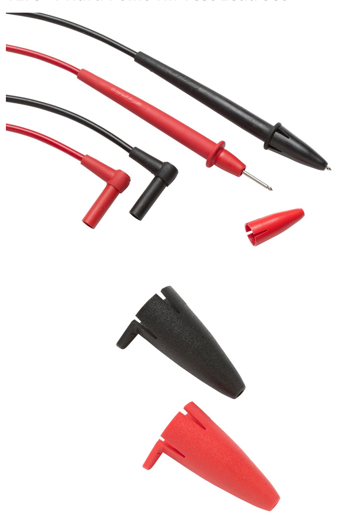
TL75 -1 Hard Point TM Test Lead Set